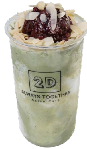
MATCHA red beans, almonds