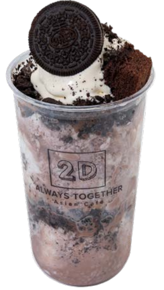
CHOCO OREO Brownies, vanilla ice