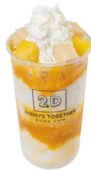
MANGO cheesecake, whip cream