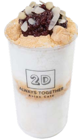
INJEOLMI soya powder, rice cake, red be- ans, almonds