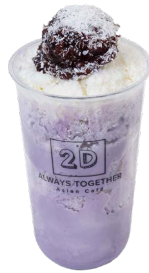
UBE red beans, coconut flakes