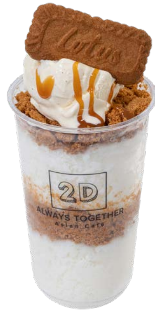
BISCOFF CARAMEL vanilla ice