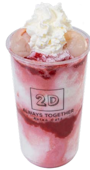
RASPBERRY lychee, whip cream